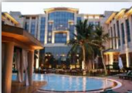
Hyatt Regency, Kolkata Keys: 233