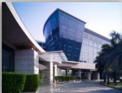
Hyatt Regency, Mumbai Keys: 401