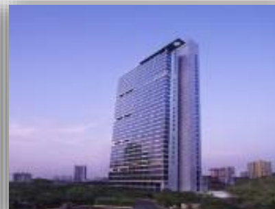
Four Seasons, Mumbai Keys: 202