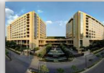
Hyatt Regency, Pune Keys: 222 Apartments: 88