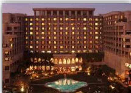
Hyatt Regency, New Delhi Keys: 507